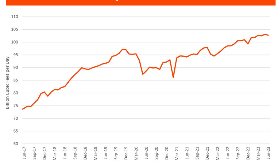
Monthly dry gas production is reported on a two-month lag. Despite the continued low-price environment, production continues to stay near the all-time high set in Mav.